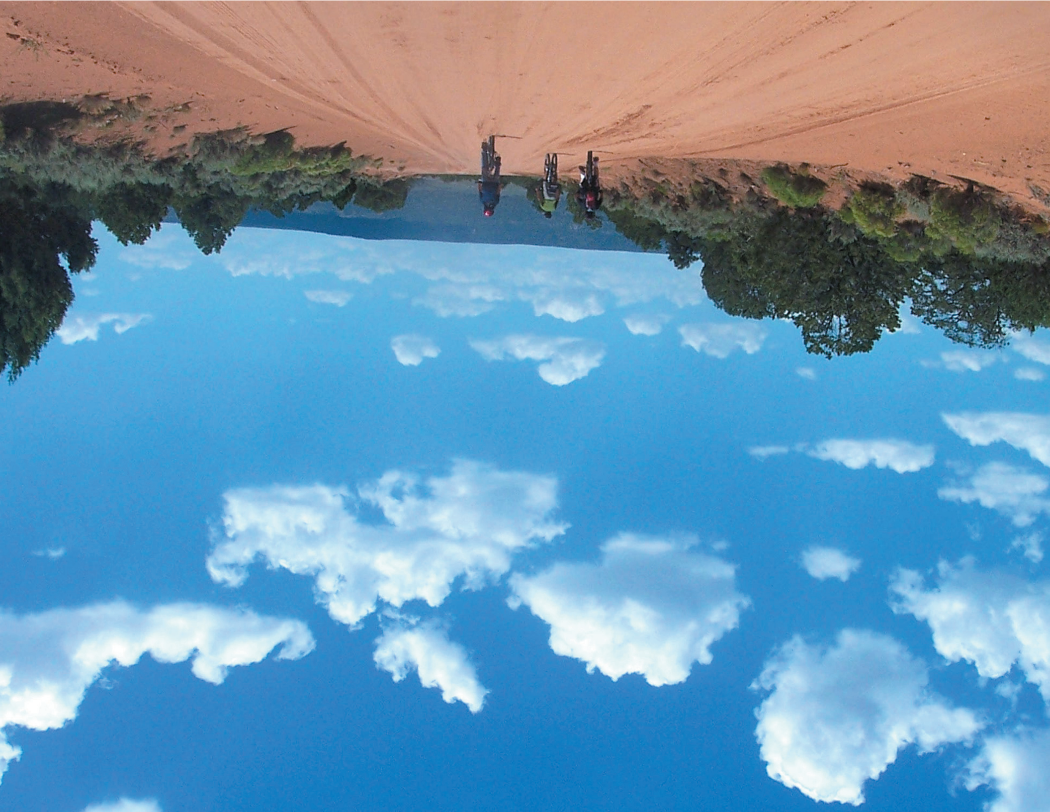
Kayenta students in Grand Canyon