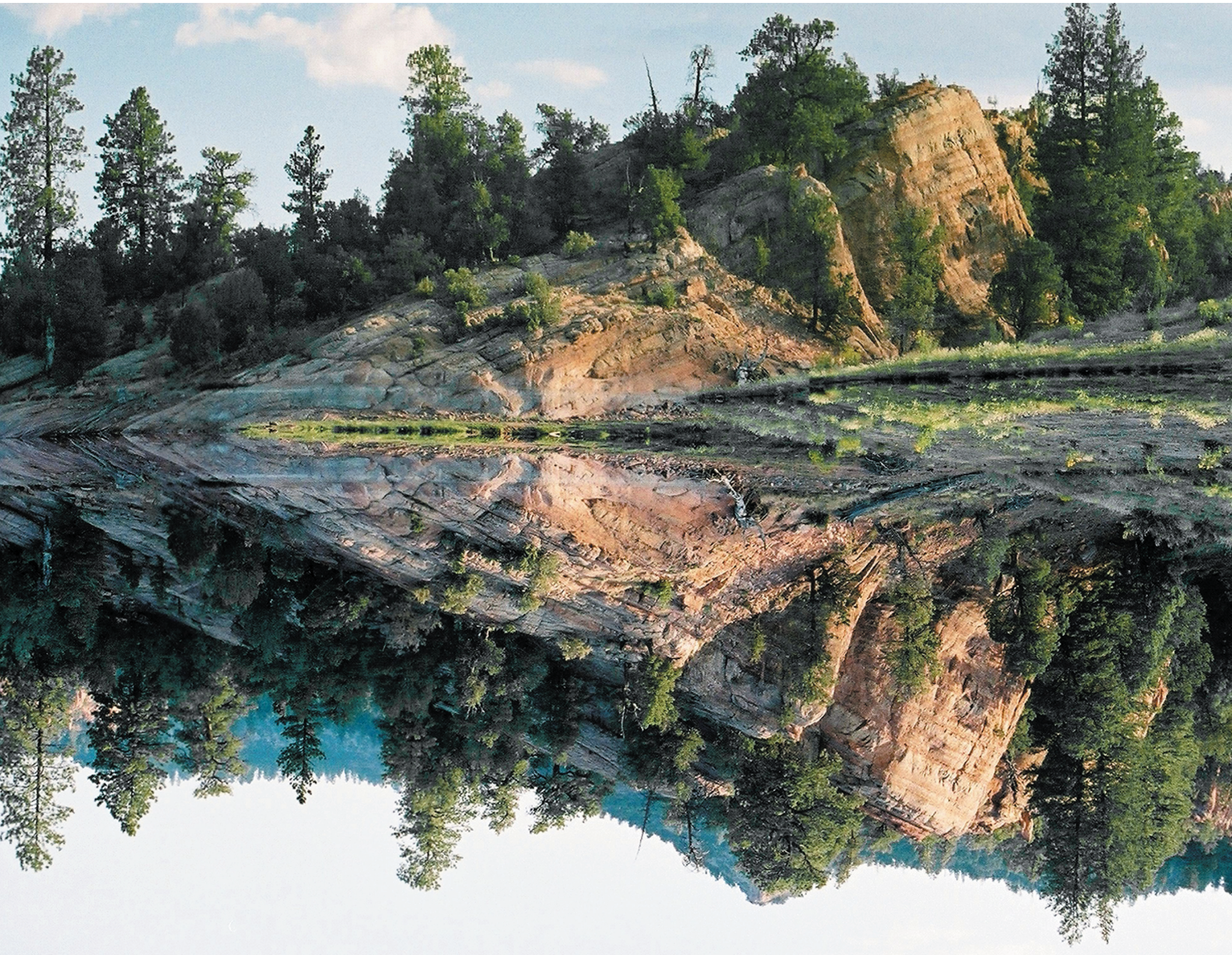
Sunset over Lake Powell