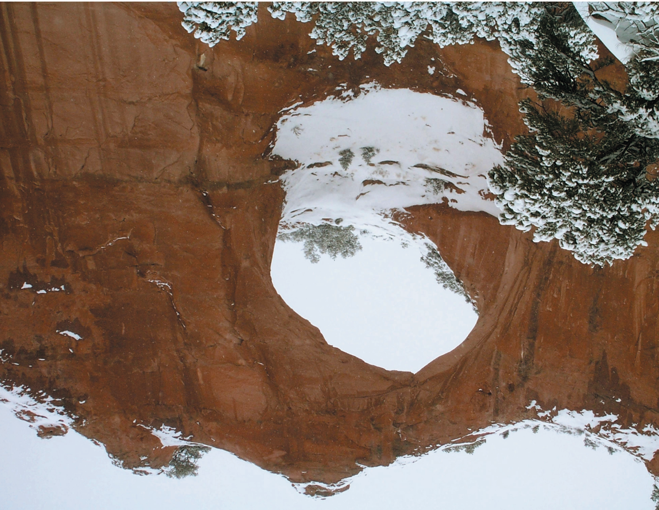
Winter whites near Narbona Pass